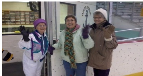
These ladies enjoying the Adult/Senior Open Ice Skating

If you have never skated or haven't skated in a long time this is the perfect opportunity for you to get out and try it, without having to worry about a lot of people around you. For