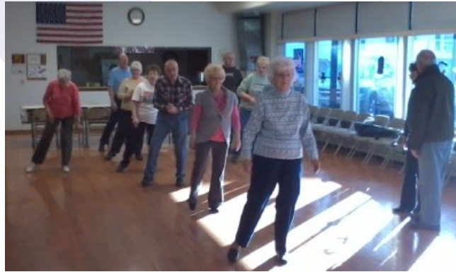
Line Dancers cutting a rug at the Activities Center