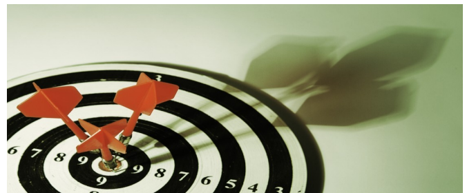
501 Dart League every Thursday morning through the month of February.

The nice thing with playing Wii Darts is that you don't have to walk back and forth and pull the darts out of the board, and you don't even have to stand up, you can play from your chair.